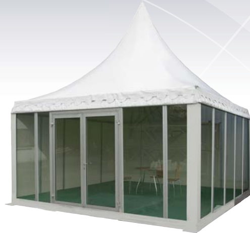
Pavilion with a second glass wall (in option)