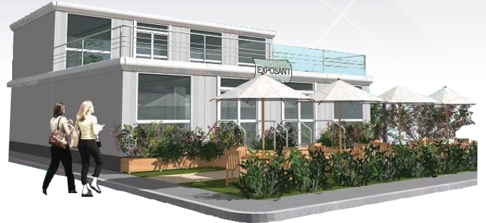
Chalet two levels