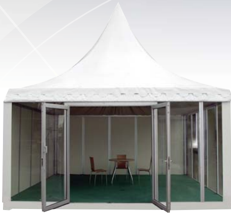
Pavilion with a glass wall