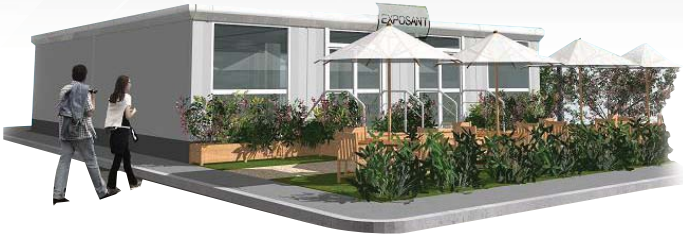
Chalet one level

The best way to receive your VIP guests in a privileged setting.