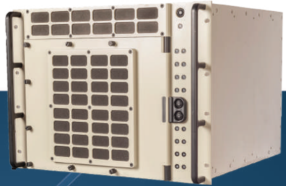
SecureARX Multi Channel Modem

AUGMENTING YOUR GOVERNMENT SATELLITE RESOURCES by OFFERING MILITARY GRADE PROTECTION