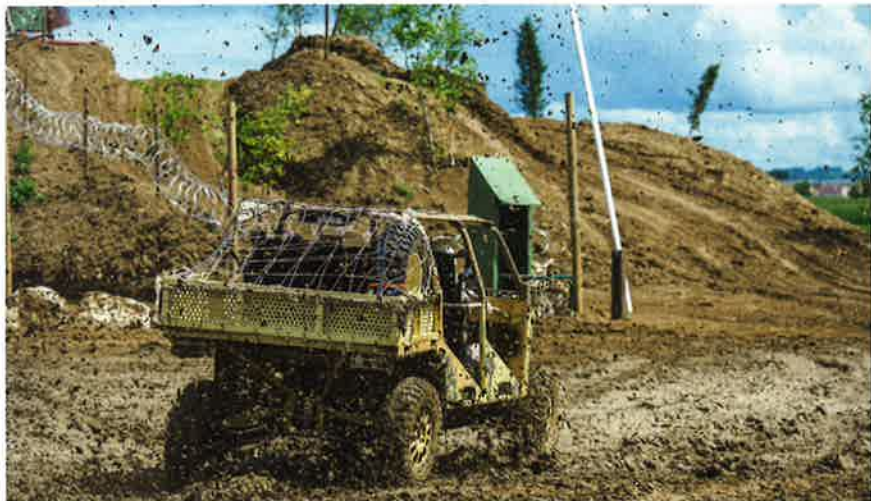
The exhibition premises offer dedicated areas for live demonstrations.

headed by ministers, vice-ministers, secretaries of state, chiefs of staff, national armament directors, general directors of police, gendarmerie, civil defence and custom. To ensure the best possible visiting programme for the exhibition and to facilitate the organisation, the organiser provides delegations with 3-day visiting schedules adapted to their interest and supported by an escort officer. However, it is the chief of the delegations' decision to fix the final visiting programme.