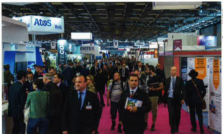
In 2016 Eurosatory attracted more than 57,000 visitors.

Today, Eurosatory is the number 1 international land and air-land defence & security exhibition. In 2018, the 26th edition of Eurosatory offers an exceptional conference programme as a forum for the discussion of new trends and to meet leading experts.