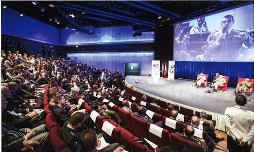
An extensive conference schedule will be part of Eurosatory's communication concept this year.

Colas des Francs: In 2016, Eurosatory hosted 212 official delegations from 94 countries comprising 821 VIP delegates total. More than 200 global official delegations are expected for 2018. Eurosatory hosts many official delegations