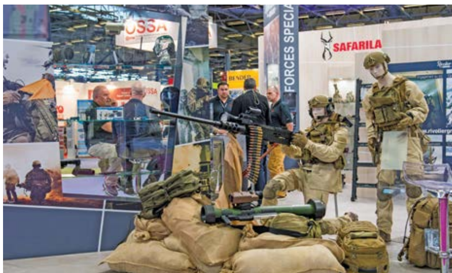
TOP AND BOTTOM Visitors at Safran stand; a mock-up stand of soldiers handling arms and ammunition

ic and strategic analyses. As in previous years, Eurosatory 2018 will invite highly qualified and motivated professional visitors from five continents. The audience will comprise international decision-makers and institutional users.